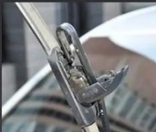
Fasteners fall off

Parts fall off, so that the wiper cannot be used normally when driving in the rain! Causes blurred vision ahead!