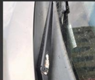
Wiper arm loose