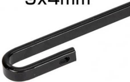
J&U HOOK 9x4mm