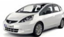
Fit ( jazz)