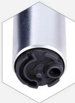
Excellent material and high quality