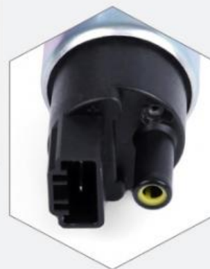
Welding process high standard