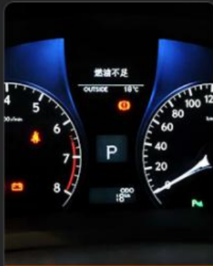
Increased fuel consumption