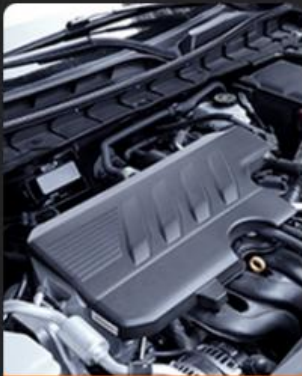
Reduced engine power