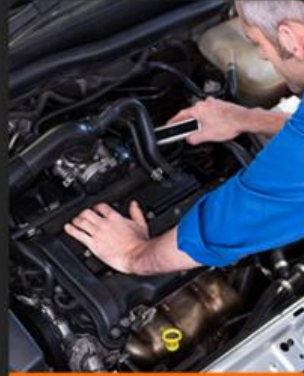
Burn oil cylinder